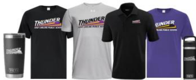
ALTERANTE COLOURS AVAILABLE IN PRODUCT SHOWN