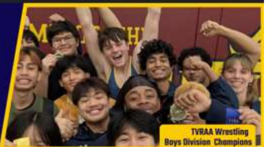
TVRAA Wrestling Boys Division Champions