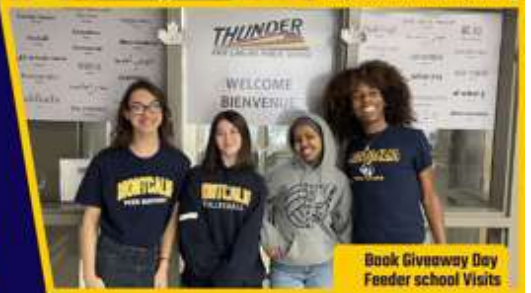
Book Giveaway Day Feeder school Visits