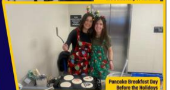
Pancake Breakfast Day Before the Holidays