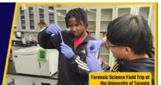
Forensic Science Field Trip at the University of Toronto

Pancake breakfast for students one and all, happy holidays!