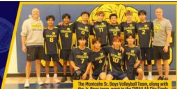
The Montcalm Sr. Boys Volleyball Team, along with the Jr. Boys team, went to the TVRAA AA City Finals