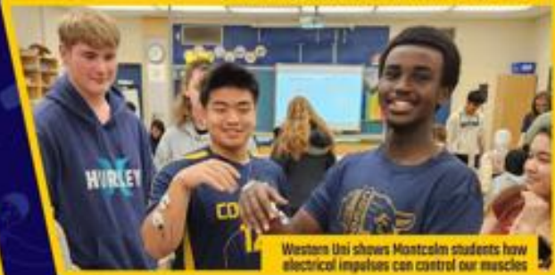
Western Uni shows Montcalm students how electrical impulses can control our muscles