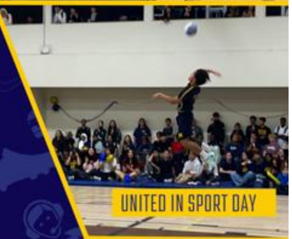
UNITED IN SPORT DAY